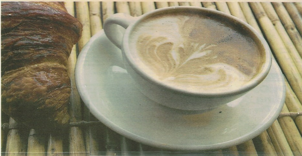
Café-Rossella coffee made at the Coffee Labs Roasters on Main Street in Tarrytown.